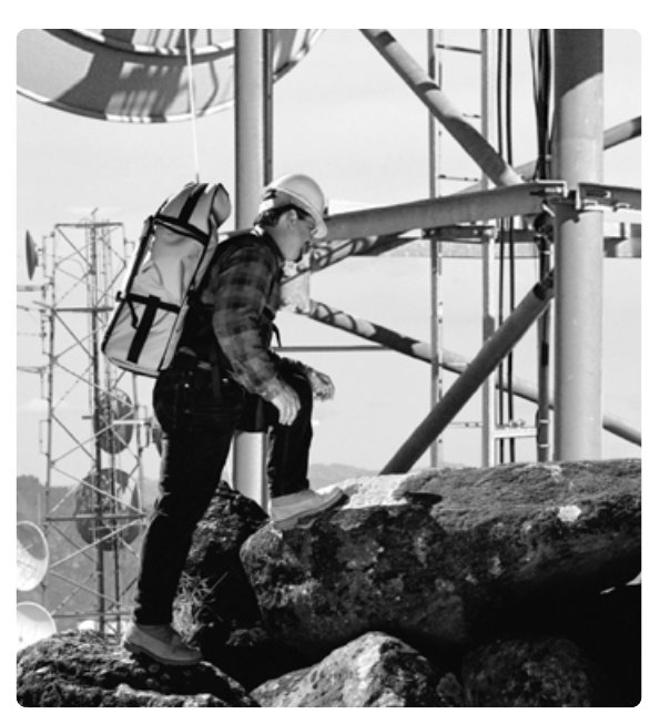
Custom backpack for carrying the ESA series analyzer (042, 044)